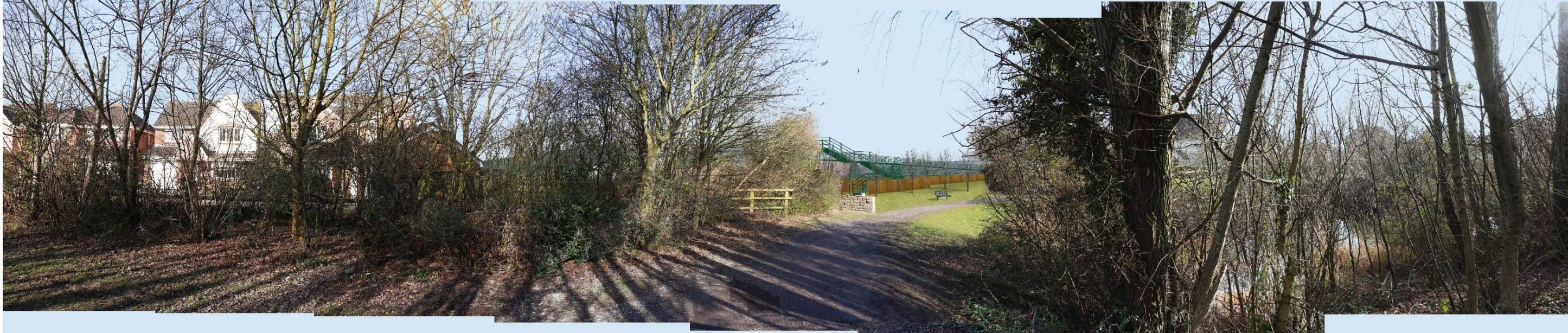
1.4.2 Bridge grey