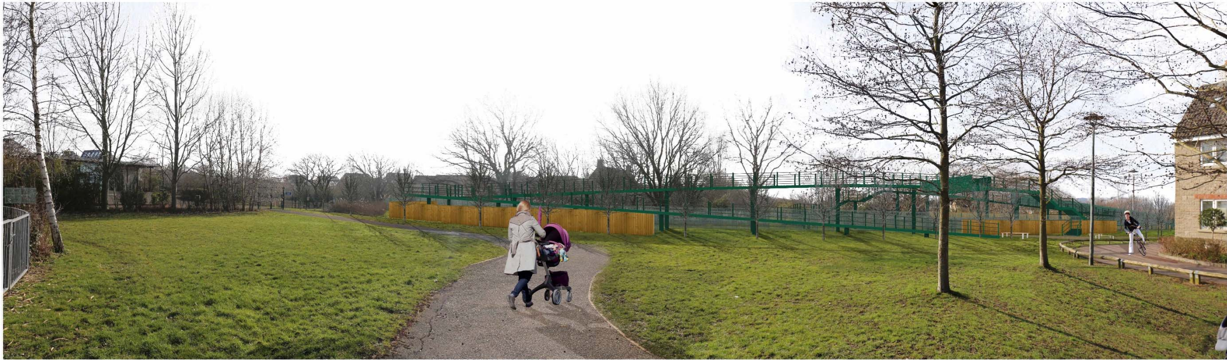
1.3.2 Bridge grey